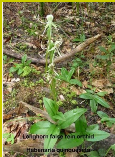
Longhorn false rein orchid Habenaria quinqueseta

August saw a large turnout for our field trip to Dead River Park on the Hillsborough River. Our group strolled along the river looking for interesting plants, fungi, birds, reptiles, and vistas. We found them all! We almost stepped on a banded water snake who was preparing to shed his skin. We found three orchid species, two in bloom – Epidendrum conopseum and Habenaria quinqueseta . Fungi abounded as rain had been plentiful. We wandered along the river enjoying large oaks covered with shoe string ferns and resurrection ferns. We explored the floodplain forest including a side swamp. Mosquitoes and ticks largely left us alone, and a thunderstorm kindly waited to arrive until after our walk. Enjoy the photos of our trip on our web site: http://www.SuncoastNPS.org .