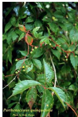
Parthenocissus quinquefolia