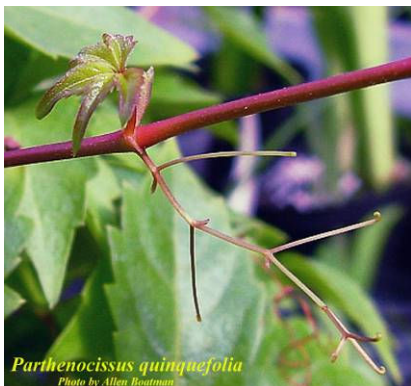
Parthenocissus quinquefolia