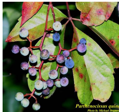
Parthenocissus quinquefolia