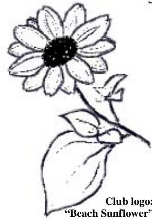
Club logo: "Beach Sunflower" Helianthus debilis